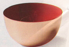
BOWL Louise Bowls in copper, from $50; hawkins newyork.com