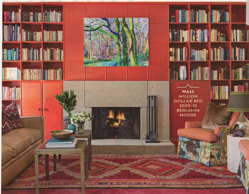
WALL MILLION DOLLAR RED 2003-10 BENJAMIN MOORE