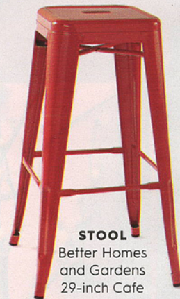
STOOL Better Homes and Gardens 29-inch Cafe Stool in red, $39.97; walmart.com