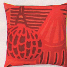
PILLOW Kumiseva Cotton Cushion Cover, $45; us.marimekko .com