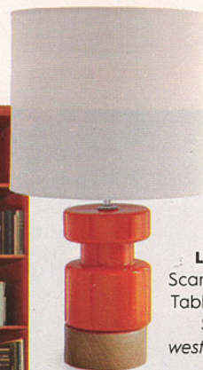
LAMP Scandi Glass Table Lamp, $129; westelm.com